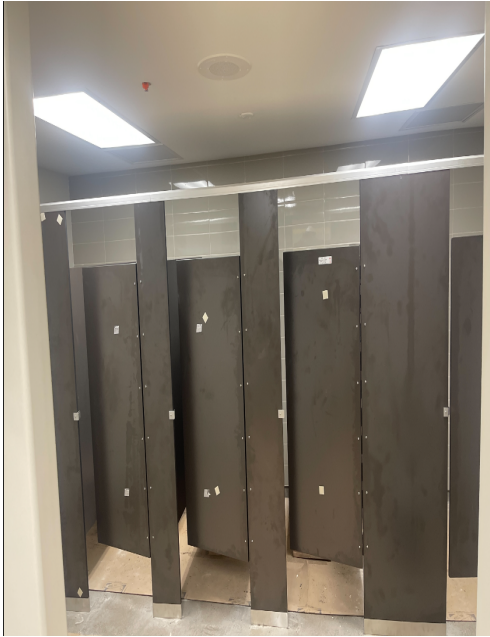
Toilet compartment install is complete