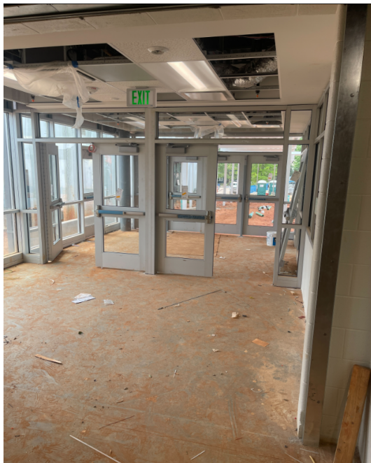
Storefront install is 95% complete