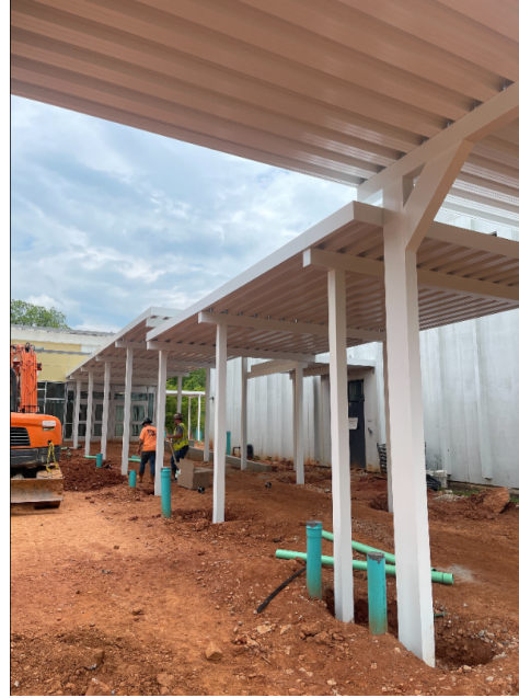
Canopy install is complete